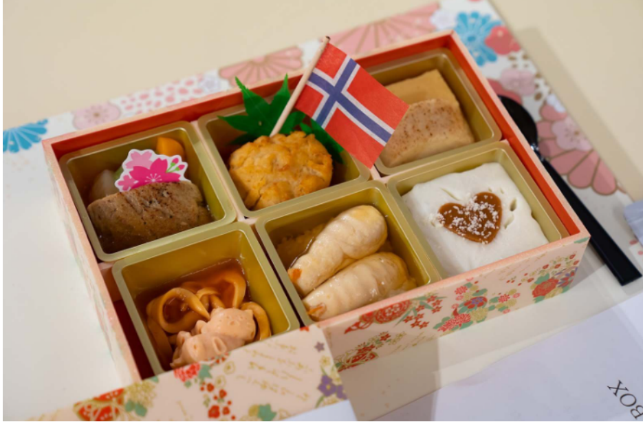
The Mogumogu Box bento, where the soft karaage (fried chicken) was a particular hit.