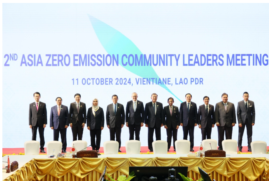
AZEC Leaders Meeting, Vientiane, Laos, 11/10/2024.

From a relationship of giving and receiving to a co-creating partnership—Japan's Official Development Assistance (ODA), which marks its 70th anniversary this year, is set to undergo a major change. ODA in the past was primarily request-based, meaning assistance was provided to countries that requested it, but Japan newly introduced an offer-based approach in which it proactively offers assistance that takes local circumstances into consideration. These initiatives have already started in Southeast Asia and Africa.