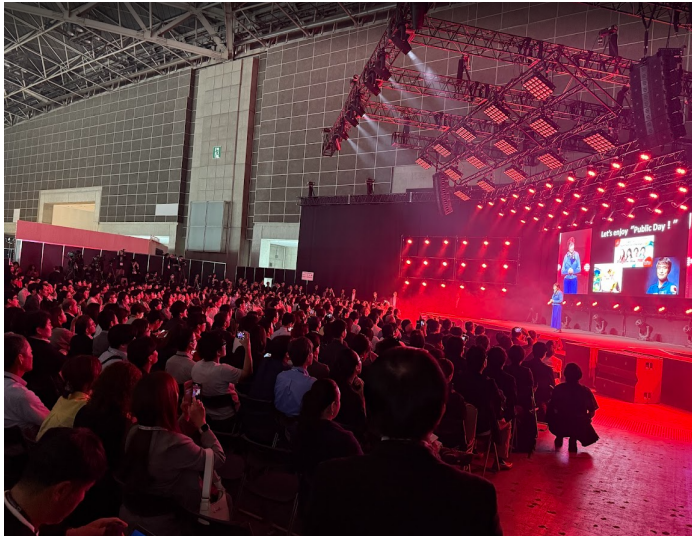
SusHi Tech Tokyo 2025