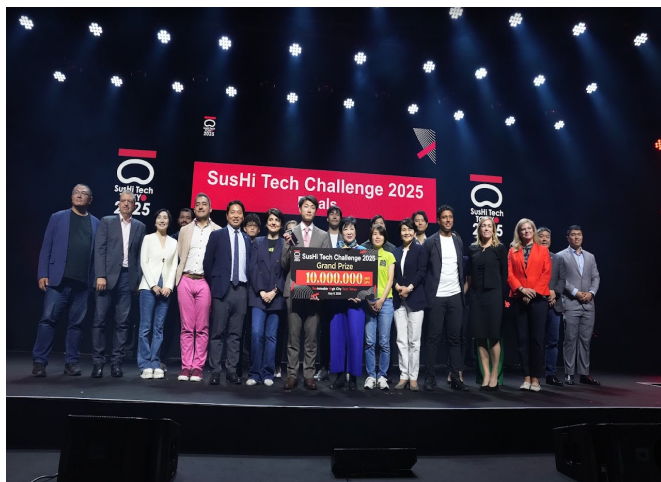
SusHi Tech Tokyo 2025.